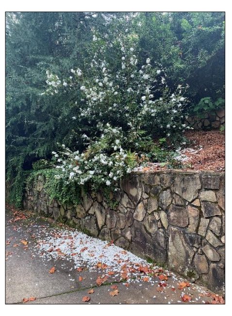
Camellia 'Snow Flury' in Jack Driskell's Garden