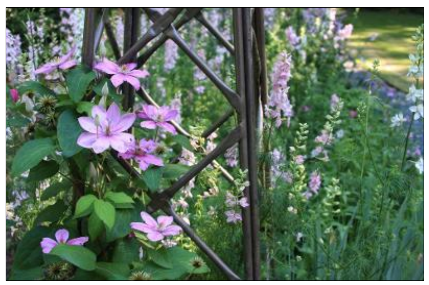
A scene from GHS member Pat Brussack's garden. Here you will find many beautiful hostas grown to perfection. You will also find a wide variety of companion perennials including a superb collection of epimediums. You can also see many beautiful hostas and a host of companion plants in member Sandra Bussell's garden.

This will be a self-guided tour. Details and a garden location map may be found at the Piedmont Gardeners web site at <a href="https://www.piedmontgardeners.org/">https://www.piedmontgardeners.org/</a>. While you are in Athens, please take the time to visit the Georgia State Botanical Garden. It is a wonderful garden and includes trial gardens for new plants to determine how well they will grow in our climate. Recently opened on the grounds of the garden is the magnificent Porcelain and Decorative Arts Museum which houses the Deen Day Sanders porcelain and decorative art collection. For more information about the museum, go to its web site at <a href="https://botgarden.uga.edu/porcelain-and-decorative-arts-museum-timed-access-now-available/">https://botgarden.uga.edu/porcelain-and-decorative-arts-museum-timed-access-now-available/</a>.