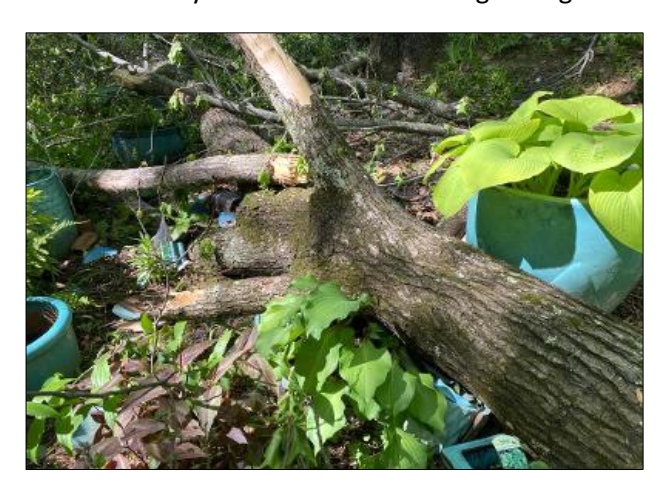
Kay's Garden Afterwards