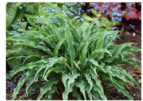
Hosta 'Silly String'

to allow time for professional filming of virtual tours of each of the gardens originally scheduled to be on tour. Then the convention committee went to work revamping the various meetings and presentations so that they could proceed in the form of a virtual meeting via Zoom. The result will be superb online garden tours, the usual interesting lineup of speakers, committee meetings, and the annual business meeting. There will even be a hosta show photo contest and a virtual seedling competition. AND there will be a free convention plant which will be mailed to each participant. The convention hosta this year is H . 'Silly String', an exciting small and extremely ruffled H . 'Curly Fries' seedling created by Hans Hanson and provided by Walters Gardens.