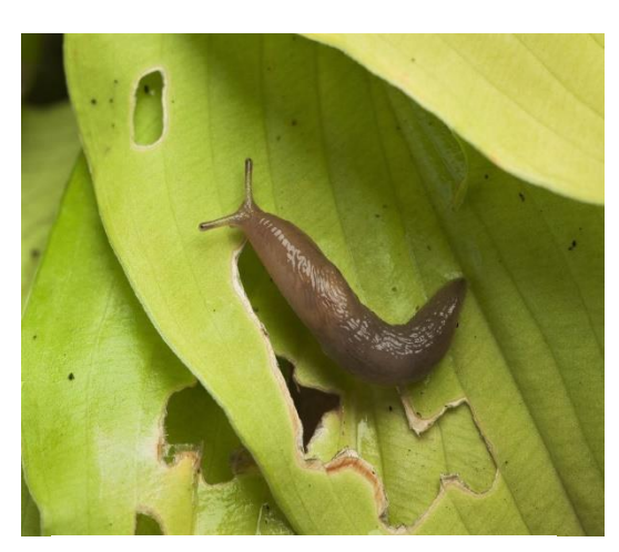
Slug Devouring a Hosta Leaf

We avid gardeners have been waiting for months for this moment. But we are not the only ones waiting. Slugs! All those overwintering slug eggs are now hatching and any slugs that have survived the winter are beginning to feed regularly and lay even more eggs. It is still chilly outside, maybe even downright cold, but don't procrastinate. Now is the time to attack.