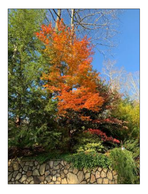
Magnificent Japanese Maple In Jack Driskell's Garden