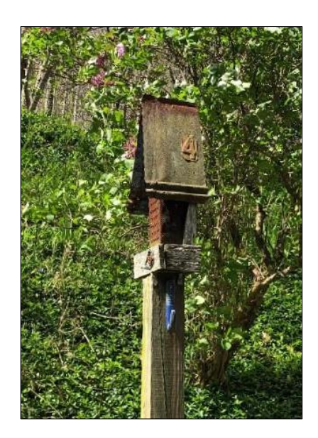
Garden Art Pictures From Others' Gardens