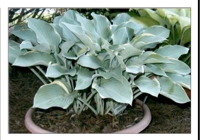
Hosta 'Regal Splendor'