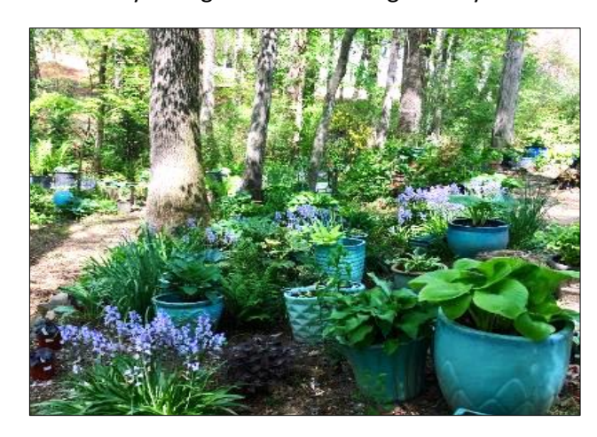
Kay's Garden Before the Trees Fell

Not all garden changes are good as we well know from experience. Kay Cook's beautiful garden was partially wrecked by falling trees from a neighbor's yard. Never fear. We all know Kay will build it all back to great again!