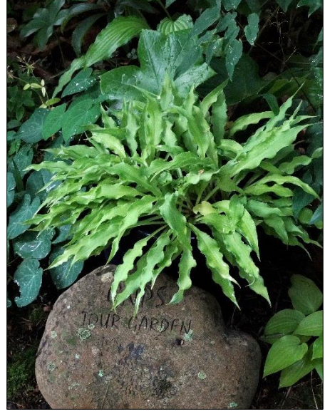
Hosta 'Curly Fries'