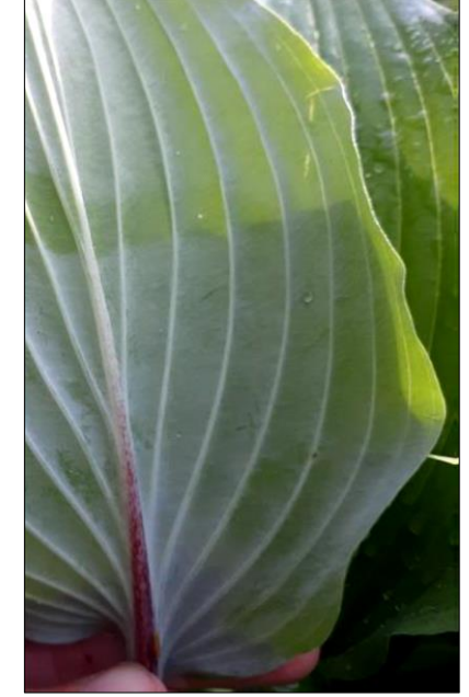
2. Lower leaf, H. 'Red October'