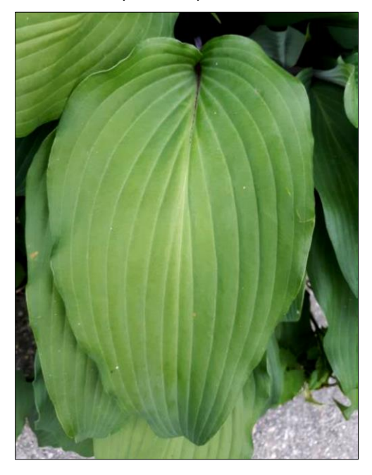
1. Upper leaf, H. 'Red October'

The photographs are of my H. 'Red October', a variety registered with 11 VP. I counted 9 VP on multiple leaves. I think the low VP is due to my cultural practice of not fertilizing or watering.