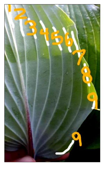
3. Counting Vein Pairs (The curl of the leaf hides part of Vein 9)