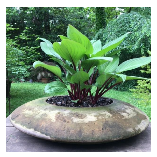
H. 'First Blush'

Clockwise from rear -Hostas 'Praying Hands', 'Little Wonder', 'Blue Mouse Ears', 'Shining Tot', and 'Munchkin Fire'