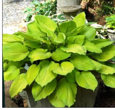
Hosta 'Squash Casserole'