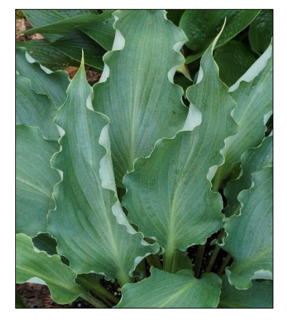
Seedling 2018-41 -Harold McDonell