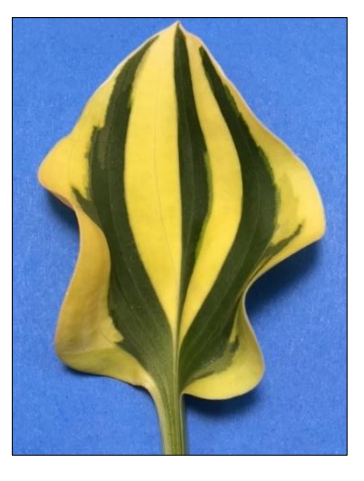
Variant Leaf of H. 'School Mouse'